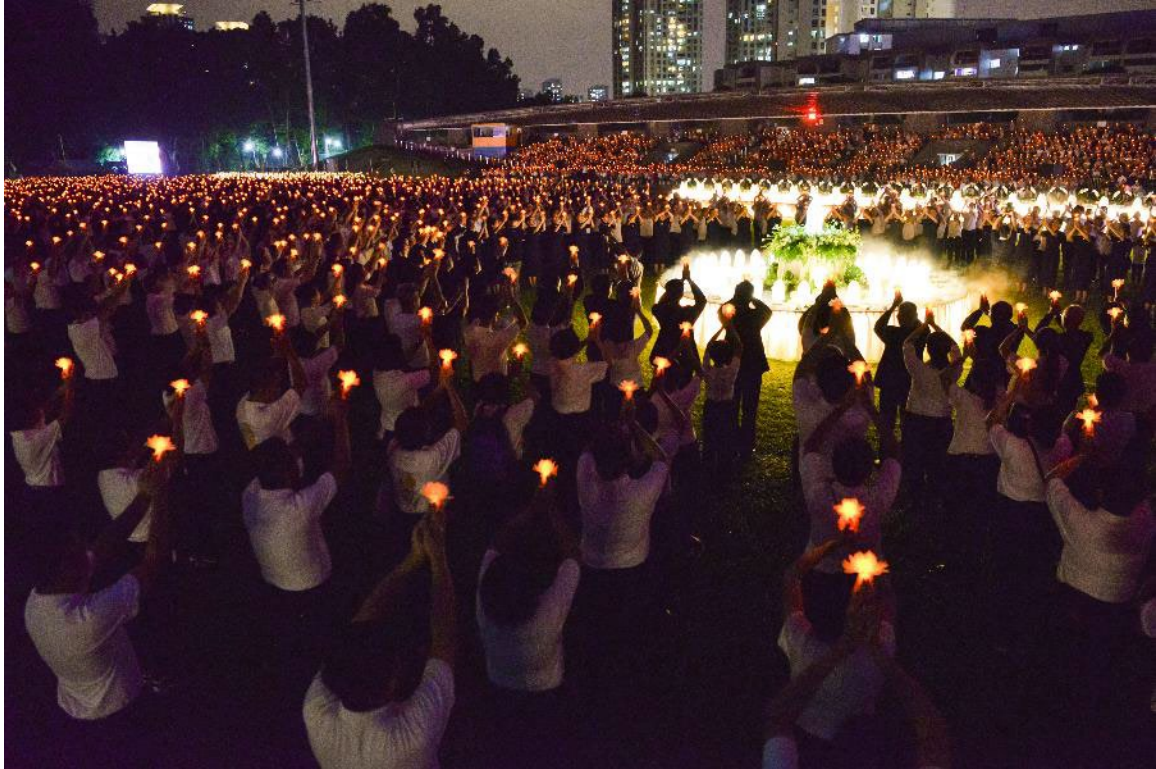
A shot of Tzu Chi volunteers' group formation at night during the 2019 event. (Photo by Tzu Chi Merit (Singapore))

The TC57 in the circle of the same heart symbolises the volunteers' tireless efforts in the past 57 years to spread Tzu Chi founder Master Cheng Yen's spirit of gratitude, respect, and love to everyone all around the world. (Photo by Tzu Chi Merit (Singapore))